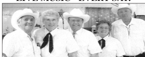
"IOWA KOUNTRY OPRY"